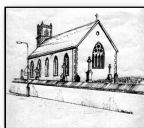
St. Joseph's Church, Glenmornan