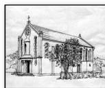
Sacred Heart Church, Derry Rd

Parish Website: www.leckpatrickparish.com