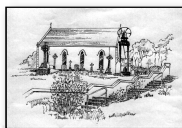
St. Mary's Church, Cloughcor