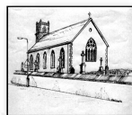
St. Joseph's Church, Glenmornan