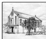
Sacred Heart Church, Derry Rd

Parish Website: www.leckpatrickparish.com