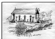
St. Mary's Church, Cloughmor