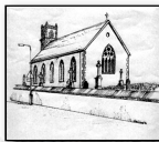
St. Joseph's Church, Glenmornan