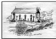
St. Mary's Church, Cloughcor