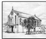
Sacred Heart Church, Derry Rd

Parish Website: www.leckpatrickparish.com